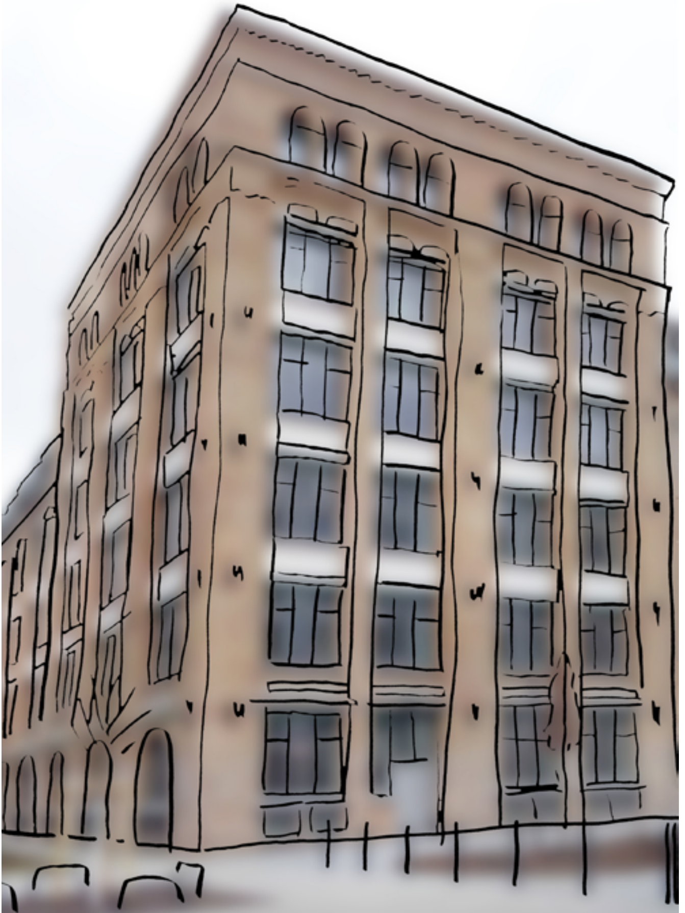
View of the building section that housed the concentration camp at the Adlerwerke Photo: Thomas Altmeyer (2022)